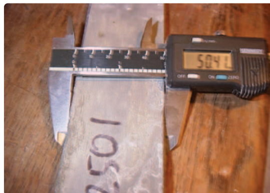
Figure 4 bottom right: Measurement of coupon dimensions.