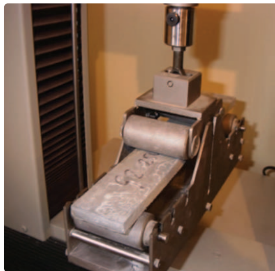
Figure 2 top right: GRC coupon in 4-point test jig.