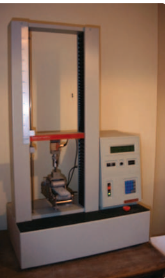
Figure 1 above: Testing machine.

By analysis of the test, normally now assisted by suitable software, together with measurement (Figure 4) of the exact dimensions of the sample, the elastic limit (Limit of Proportionality or LOP) and ultimate bending strength (Modulus of Rupture or MOR) are found. Additionally, Young's modulus for the initial elastic region of behaviour can be determined and also the strain to failure.