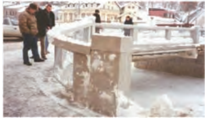
Figure 3 - Bridge in Vsetín with GRC lost formwork of parapets imitating natural granite

This research project was started with several elementary tests of the basic material – glassfibre concrete. For these test, GRC sheets were prepared by the spray manufacturing method. The GRC used for the tests was composed of: