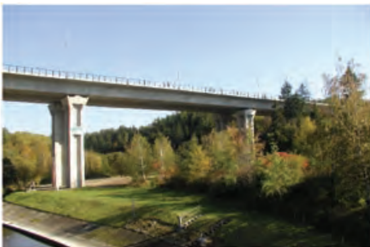
Figure 1 - Bridge in Plzeň with GRC lost formwork of pier heads