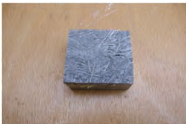
Figure 7 - Bonding strength test on a part of the test cornice Figure 8 - Specimen after a bonding strength test