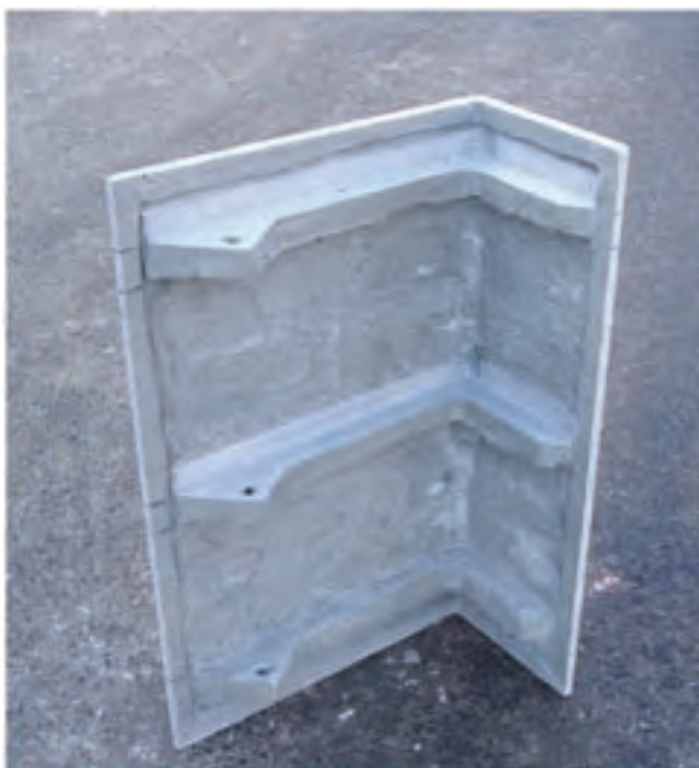
Figure 6 - GRC lost formwork of the composite test cornice