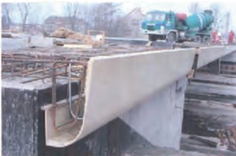
Figure 4 - Bridge in Frýdek – Místek with GRC lost formwork of composite cornices

The thickness of the plates used for preparation of the specimens was 20mm or 40mm, depending on the tests which these specimens were used for. The results of tests on these specimens are consistent with usual property values of GRC: