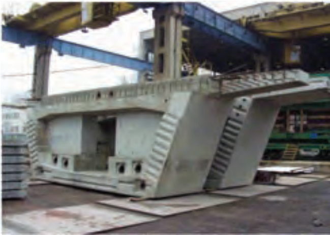
Figure 2 - Segments SMP with GRC internal lost formwork of deviators